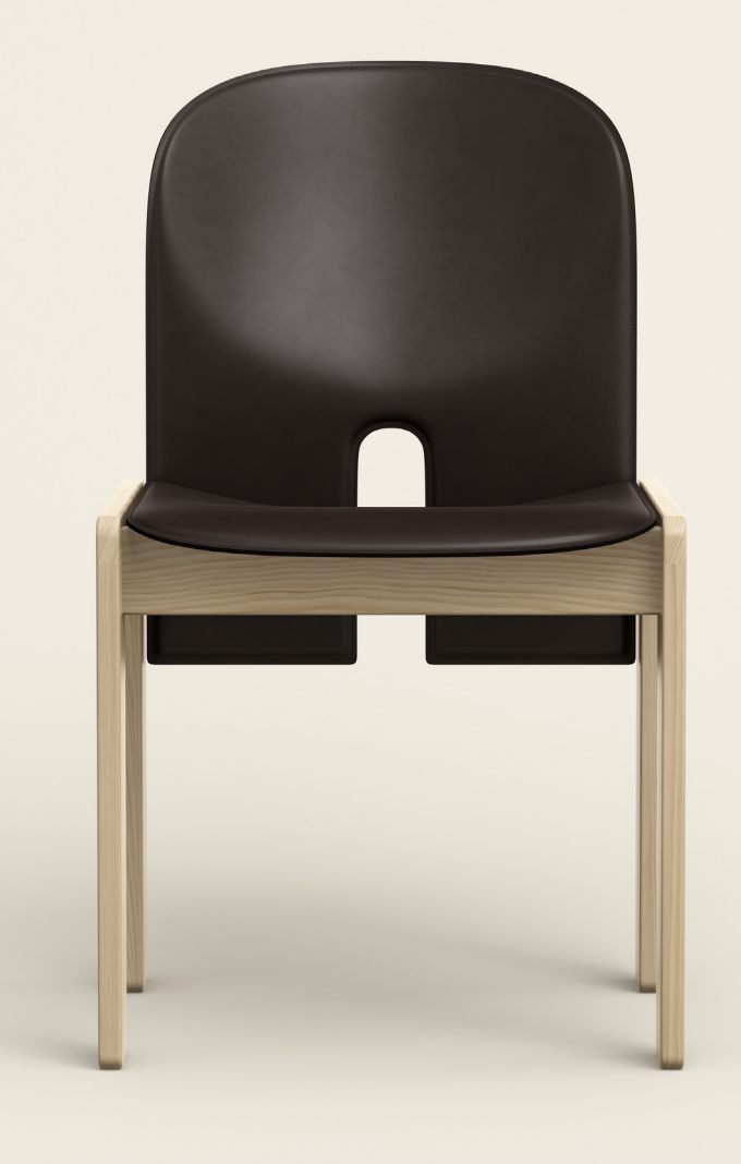
Scarpa 121 Design Afra & Tobia Scarpa Year 1965