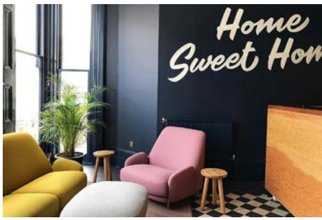
EF International Language Residence (Brighton, Great Britain)