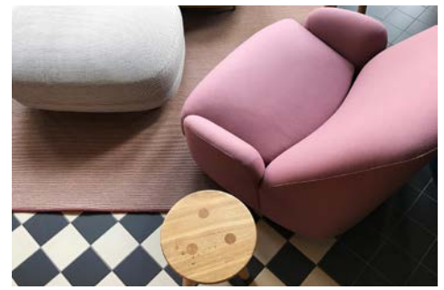
EF International Language Residence (Brighton, Great Britain)