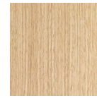
CLEAR LACQUERED OAK 172