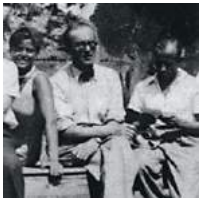
Le Corbusier, Pierre Jeanneret, Charlotte Perriand

In 1922, Le Corbusier began working in the new rue de Sèvres, Paris, atelier with his cousin Pierre Jeanneret with whom he shared research projects and design criteria in a profound and life-long professional relationship.