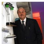
› Ernesto Gismondi