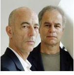
› Herzog & De Meuron